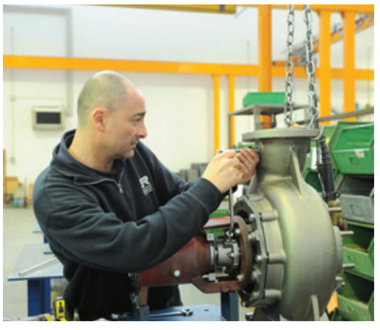
Phase of assembling