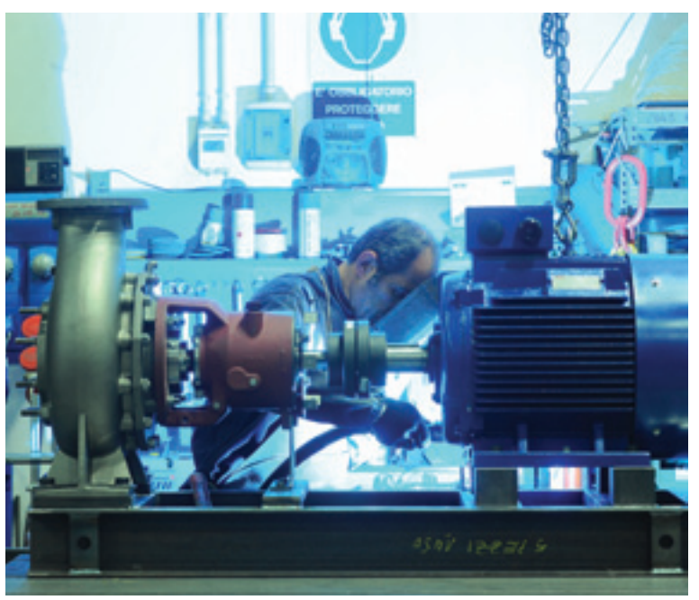
Mounting of base units